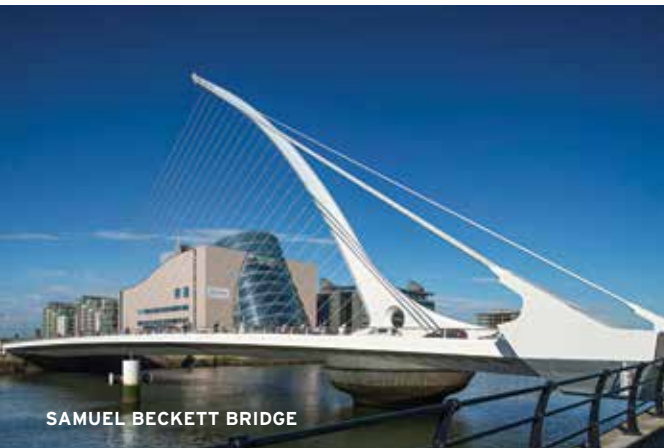
SAMUEL BECKETT BRIDGE