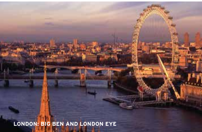
LONDON: BIG BEN AND LONDON EYE